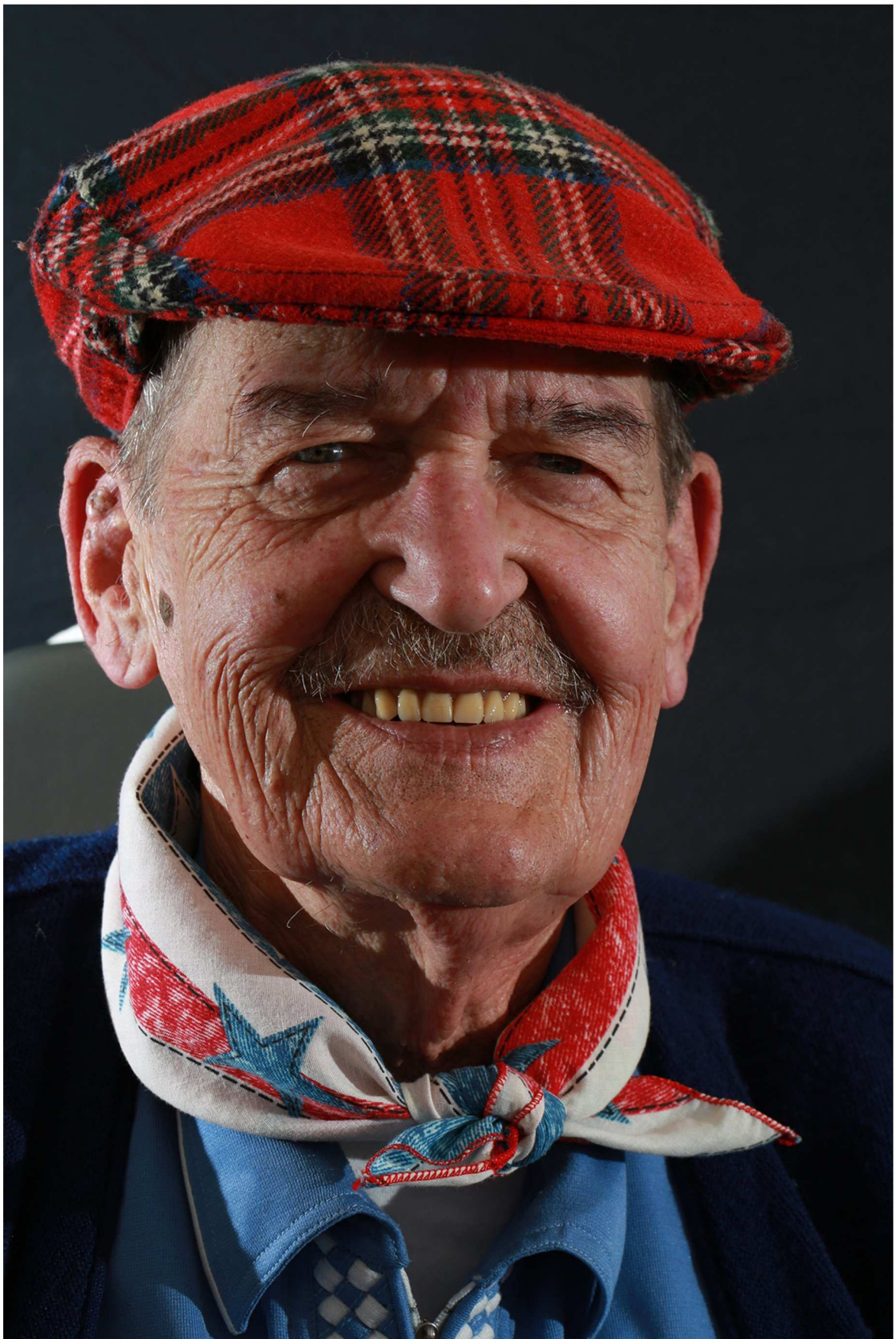
United States Army