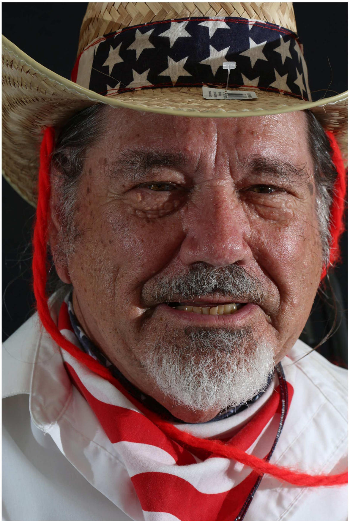
U.S. Merchant Marines/Army