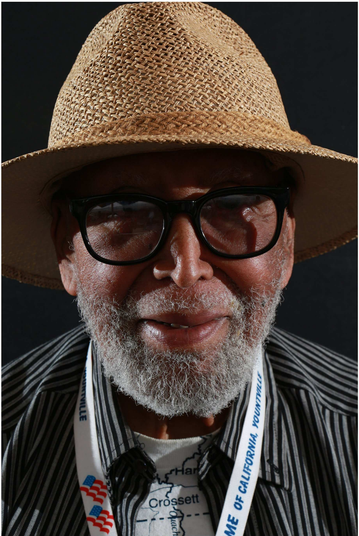
United States Coast Guard