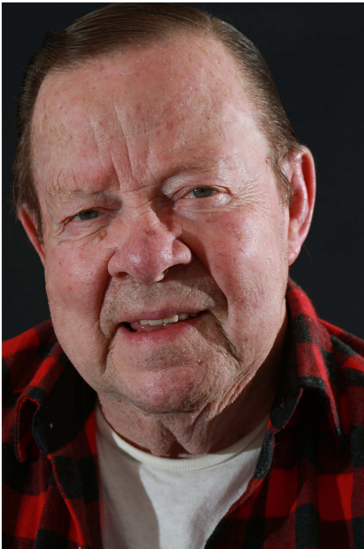
United States Air Force