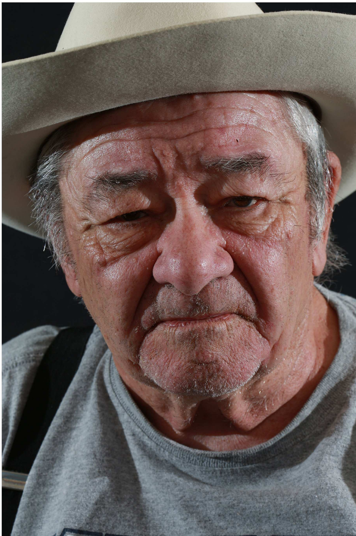
United States Army