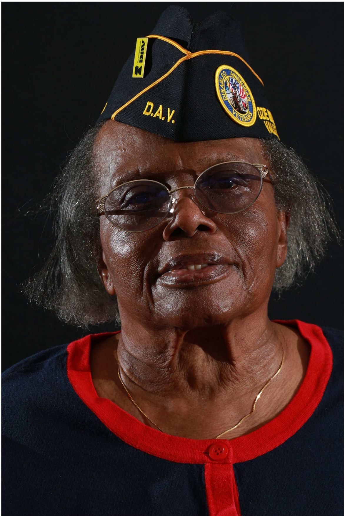
United States Navy