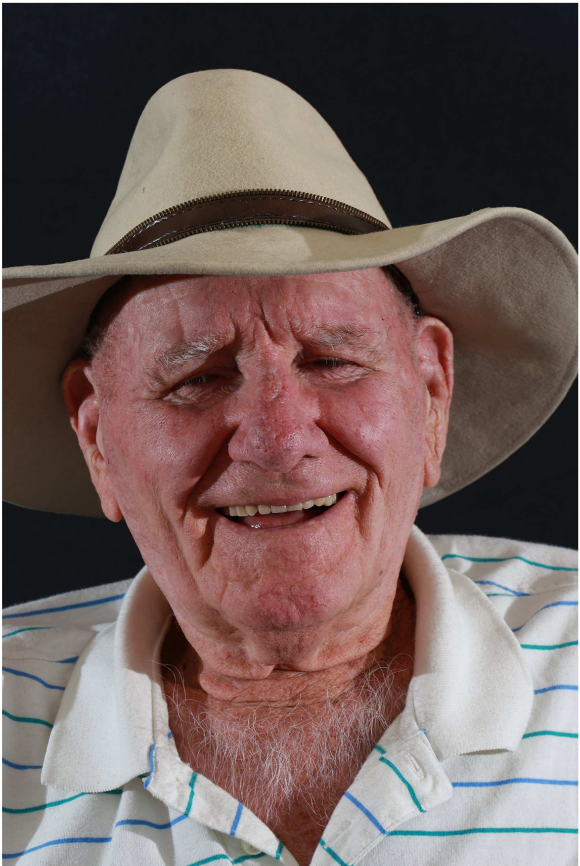
United States Army