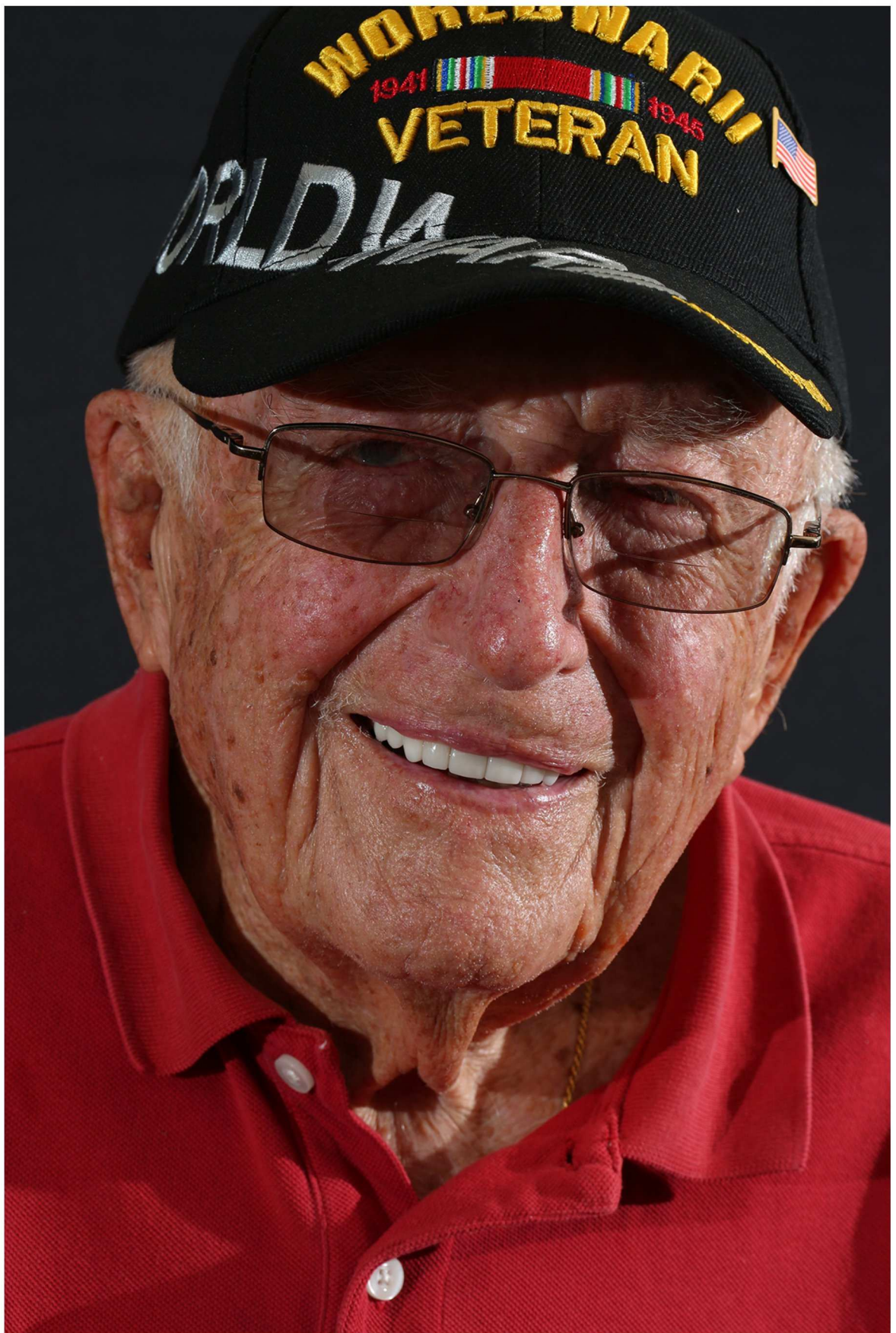
Army Air Corp