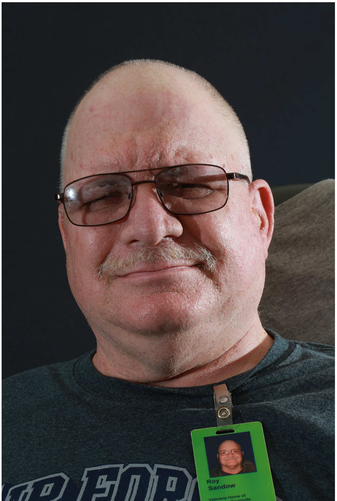
United States Air Force